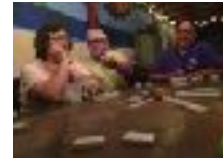
SATURDAY SHENANIGANS PAGE 6