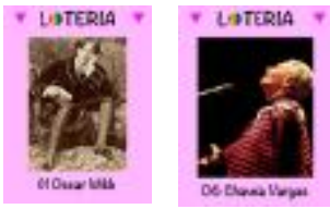
QCC LOTERIA PAGE 3