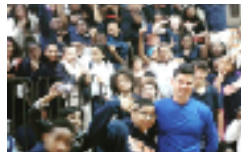
NICAVANGELISTS VISIT RBMCC PAGE 4