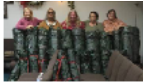
BAGS TO BED-MATS WEAVES COMMUNITY PAGE 5