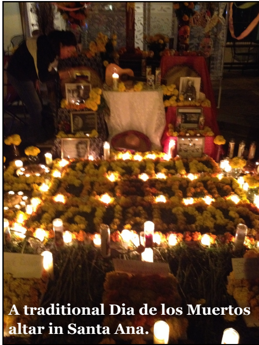
A traditional Dia de los Muertos altar in Santa Ana.